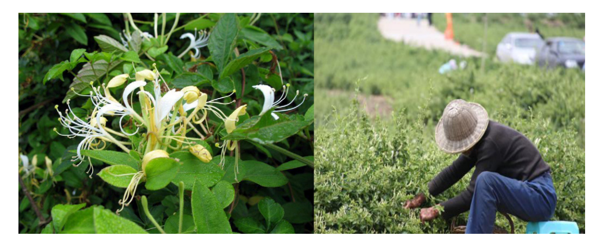
Fig. 1. The flower and habitat of Lonicera japonica.